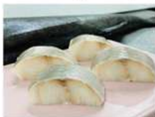
Alaskan Sablefish (Black Cod) Portions 80-100g/each piece 2 Pcs/Pack $22.50 - $90.00/kg