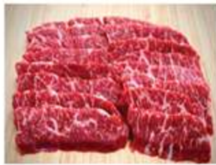
Wagyu Outside Skirt (Harami) Min. Order 0.5kg $30.00 - $60.00/kg