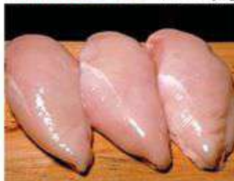
Chicken Breast Fillet Min. Order 0.5 kg $6.50 - $13.00/kg