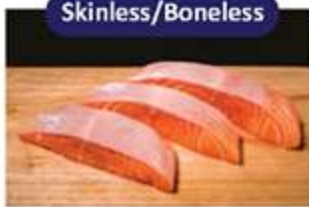
Tasmanian Atlantic Salmon Portions Min. Order 0.5kg $14.00 - $28.00/kg