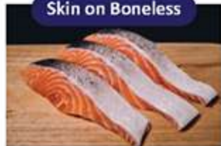
Tasmanian Atlantic Salmon Portions Min. Order 0.5kg $12.50 - $25.00/kg