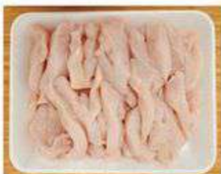
Chicken Breast Strips Min Order 0.5kg $8.00 - $16.00/kg