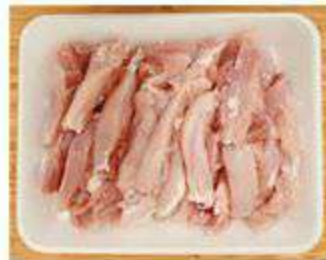
Chicken Thigh Strips Min Order 0.5kg $7.00 - $14.00/kg