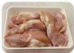
Chicken Maryland Fillet Min. Order 1 KG - $10.00/kg