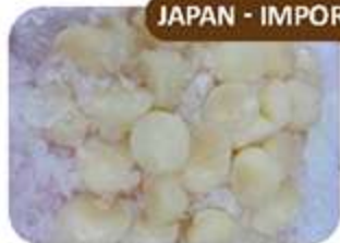
Scallop Meat Min. Order 0.5kg $12.50 - $25.00/kg