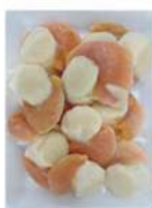
Frozen Scallops Roe On - Large China 500g/pack $15.00 Min. Order 500g/Pack $30.00/kg