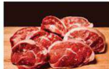
Wagyu Gravy Beef