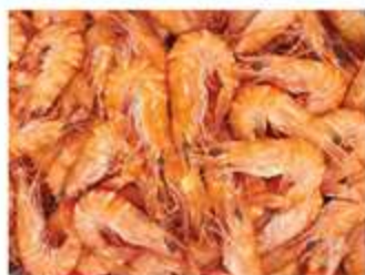
Fresh Cooked Tiger Prawn - XLarge Queensland 1 kg $34.00 Min. Order 1kg $34.00/kg