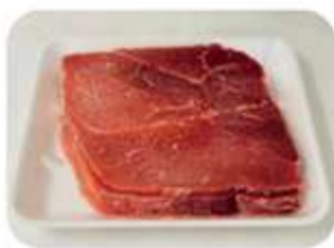
Beef Sliced Min. Order 0.5kg $7.00 - $14.00/kg