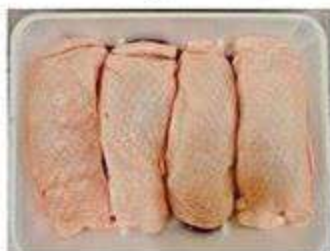
Fresh Duck Breast Fillets (+/- 180g each) 4pcs/pack $24.50 $34.00/kg