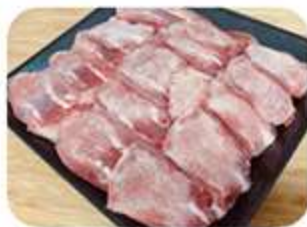
Angus Beef Tongue Sliced for BBQ Min. Order 0.5kg $13.00 - $26.00/kg