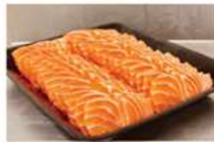
Salmon Sashimi Min. Order 0.5kg $25.00 - $50.00/kg