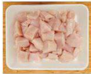
Chicken Breast Diced Min Order 0.5kg $8.00 - $16.00/kg