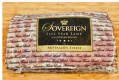
Lamb Rack (Cap On) $28/kg