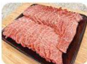
Premium Wagyu Karubi for BBQ