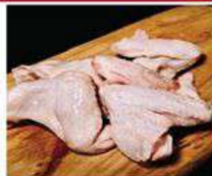
Chicken Wings Min. Order 1 KG - $6.00/kg