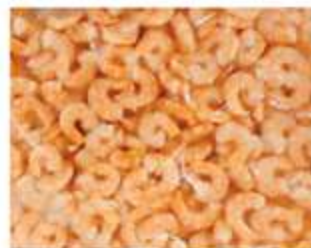
Fresh Cooked & Peeled Prawn Meat Thailand 1 kg/pack $20.00 Min. Order 1kg $20.00/kg