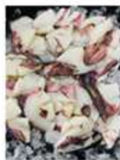
Frozen Flower Cut Squid -China