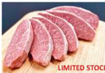
Premium Wagyu Oyster Blade Steak (Full Blood) 650g (4 steaks per tray) Min order 650g $71.50 $110.00/kg