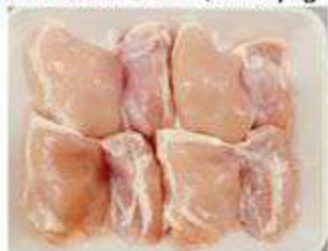
Chicken Thigh Fillet Min. Order 1 KG - $11.00/kg