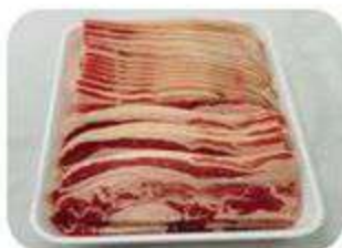
Wagyu Brisket Sliced