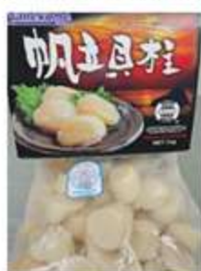
Frozen Hokkaido Japanese Scallops SASHIMI GRADE 1 kg/pack $50.00 Min. Order 1kg/Pack $50.00/kg