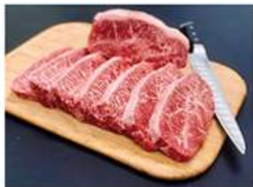
Wagyu Oyster Blade Steak (Full Blood) 650g (3 steaks per tray) Min order 650g $55.25 $85/kg