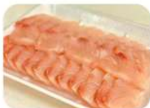
Hiramasa King Fish Sashimi Min. Order 0.5kg $30.00 - $60.00/kg