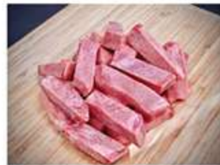
Premium Wagyu Tongue Steak Cut Min. Order 0.3kg $21.00 - $70.00/kg