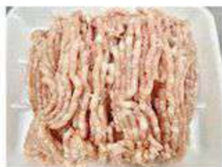
Chicken Minced Min. Order 0.5 kg $5.00 - $10.00/kg