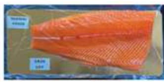
Salmon Fillet Skin Off (Boneless) SASHIMI GRADE 1.3kg/pack $36.40 Min. Order 1 Pack/1.3 kg - $28.00/kg