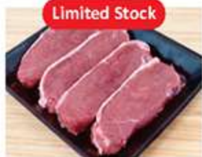
Angus Beef Porterhouse/Striploin Steak Min. Order 0.5kg $12.50 - $25.00/kg