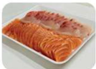
Salmon & King Fish Sashimi Min. Order 0.5kg $30.00 - $60.00/kg