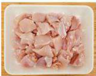
Chicken Thigh Diced Min Order 0.5kg $7.00 - $14.00/kg