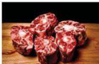
Wagyu Beef Tail