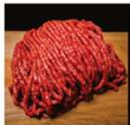
Beef Mince Min. Order 0.5kg $5.00 - $10.00/kg