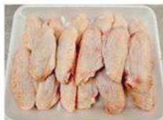
Chicken Mid Wings Min. Order 0.5 kg $4.50 - $9.00/kg