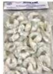
Frozen Raw Prawn Cutlet - Large Vietnam 700g/pack $30.00 Min. Order 700g/pack $42.85/kg