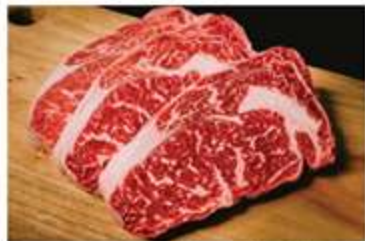
Wagyu Cube Roll/Scotch Fillet Steak MB 5+ (300g/steak) Min order 2 Pcs $42.00 - $70/Kg