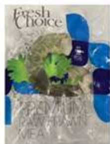
Fresh Raw Prawn Meat - Medium Malaysia 700g/pack $18.00 Min. Order 700g/Pack $25.70/kg