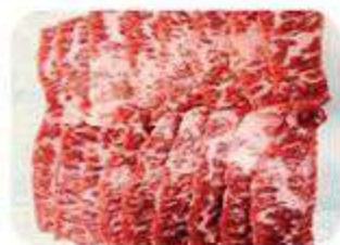
Wagyu Karubi for BBQ