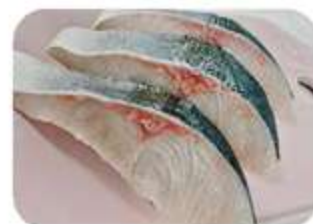
Hiramasa King Fish (Frozen) Portions Min. Order 0.5kg $27.50 - $55.00/kg