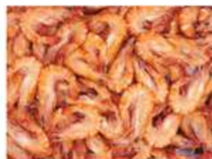
Fresh Cooked Tiger Prawn - Large Queensland 1 kg $30.00 Min. Order 1kg $30.00/kg