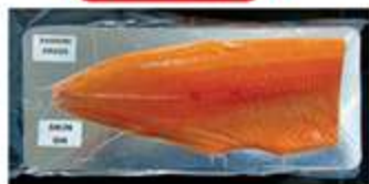
Salmon Fillet Skin on (Boneless) SASHIMI GRADE 1.3kg/pack $32.50 Min. Order 1 Pack/1.3 kg - $25.00/kg