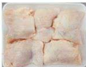
Chicken Thigh Skin On Min. Order 1 KG - $10.00/kg