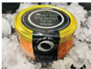
New Zealand Premium Salmon Caviar