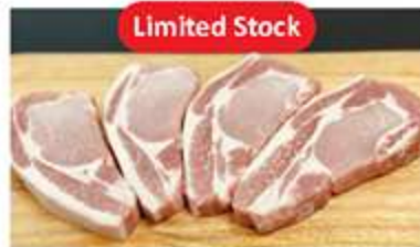
Pork Porterhouse/Loin Steak