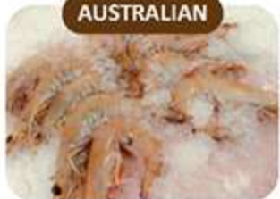
Green King Prawns (Fresh/Large) Min. Order 1 KG - $35.00/kg