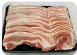
Pork Belly Slice