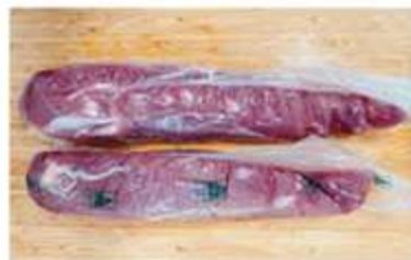
Pork Fillet Tenderloin +/- 450gr per pack