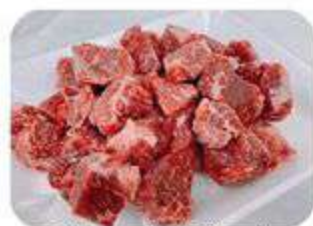
Wagyu Beef Diced