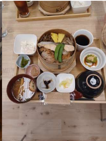
Delicious Lunch (Specialty hot steamed wappa rice)