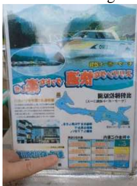
Cruises of the lake

We visited the tourist information center and there are plenty of maps in English for guest to take free of charge