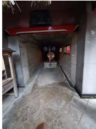
Entrance to Caves