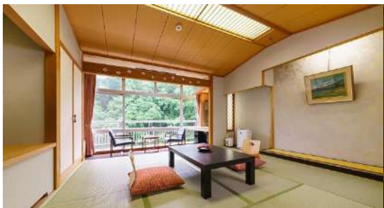
Rooms cater for different pax numbers

After Nakano Fudosan we visited Iizaka Hotel Juraku . This is an older type hotel but we were warmly welcomed by Mr Kitsunae (橘内さん). We looked first at the rooms and restaurant facilities and then the bathing areas. He also showed us many meeting places where upto 300 pax could have a private function.