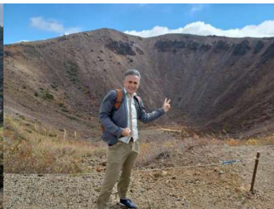
Mount Azuma Kofuji