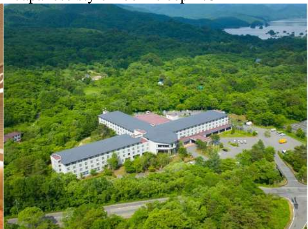
Resort Aerial image