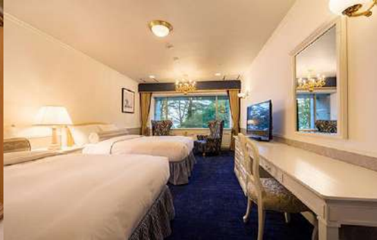
Twin rooms are big about 36m2