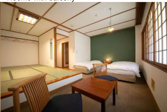
Room with beds and tatami for small groups