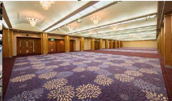
Many meeting rooms for upto 360 pax