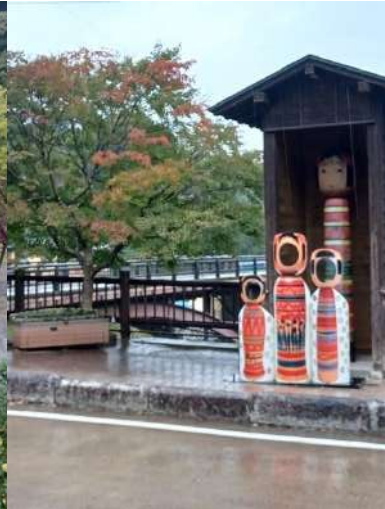
Walk around town