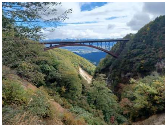
Beautiful Drive to Jododaira

After a buffet breakfast at Yoshikawa-ya we went to Jododaira Rest House . This is a wonderful drive through the mountains to see one of the main attractions which is a volcano crater. The walk to see the crater from the Rest House is about 1.1km. There is also an information center where you can get free maps and walking trail maps and camping is also an option.