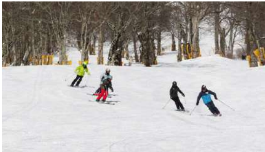
Ski Slopes minutes away