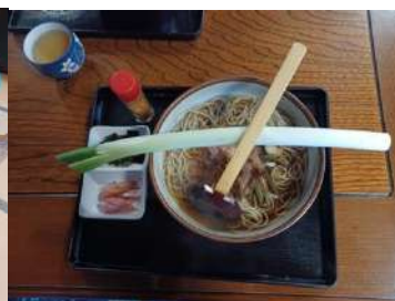
Famous negi soba