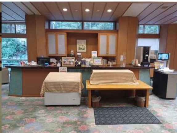
Help yourself drinks bar