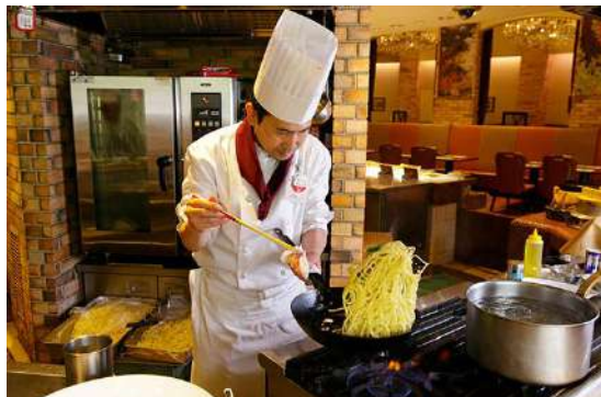
Dinner and Breakfast Buffet