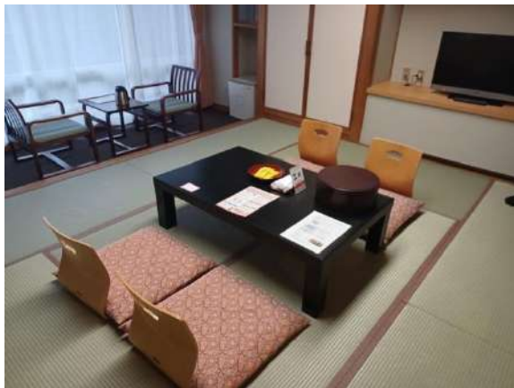
Japanese Style Room