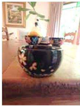
Traditional Lacquerware Lacquerware painting