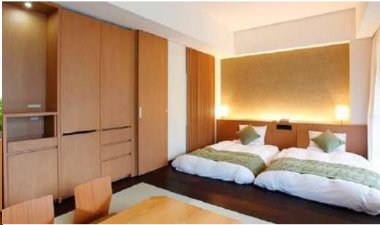
Japanese Twin Rooms