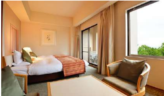
Western Twin Rooms

They already cater to guests from Australia who come for the skiing.