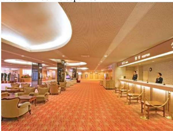
Lobby check in area