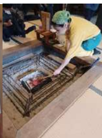
Irori at restaurant