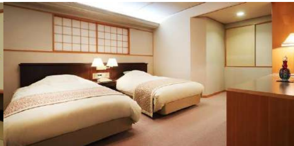
Western Twin Style room