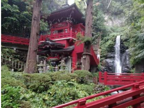
Beautiful Nakano Fudosan

We next visited Nakano Fudosan which was a very special place. It was raining when we visited but I loved the quiet serenity of this beautiful place. I learned about some of the history of this site and I learned that the caves were dug out by hand.