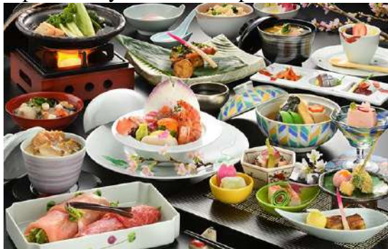
Special Meal Packages available