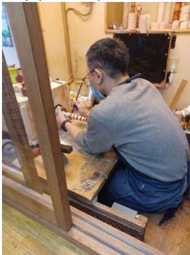
Kokeshi Doll Making