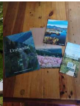
Free English brochures