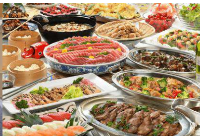
Great dinner buffet