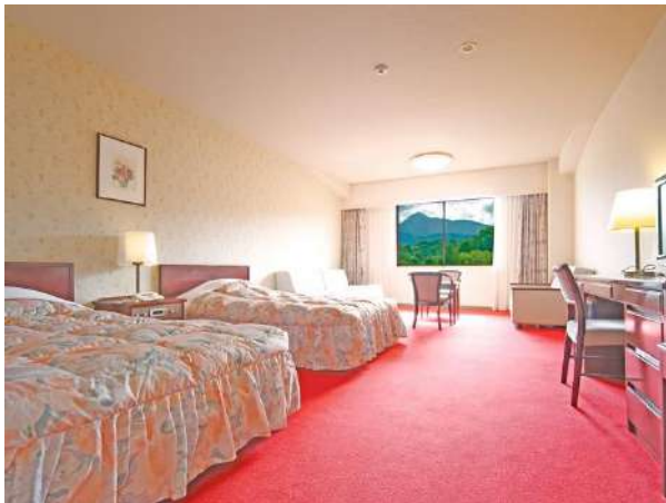
Western Room sleeps 4 /5

With many activities in the area Daiwa Royal Hotel is great for families and students. They have a special Rainbow program that is very unique in Japan and one of the few hotels in Japan to have this program that would cater for kids with special needs and the hotel is only a few minutes walk from Goshiki Ponds.