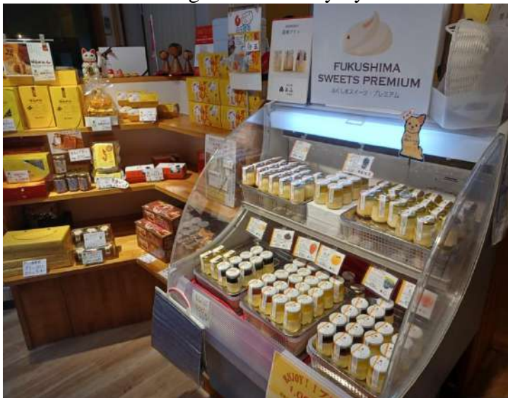
Fukushima Ken Pulin Custard Dessert