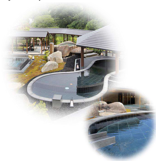
Deluxe outside onsen