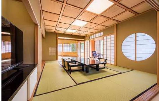
Japanese Style Room sleeps 8

This is a very deluxe resort with high end restaurants (great wine list) and very good onsen facilities.