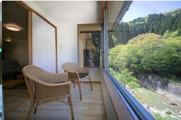
Rooms with balcony