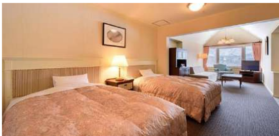
Deluxe twin room 58m2

Our final stop for Day 2 was our overnight stay at Urabandai Lake Resort Goshiki no Mori . We checked in and enjoyed a buffet dinner and buffet breakfast. The hotel was very busy as 8-10 October was long weekend in Japan so the buffet was very busy. I stayed in a Western style deluxe twin room which was very big. It had an entrance corridor and lounge to enjoy the views