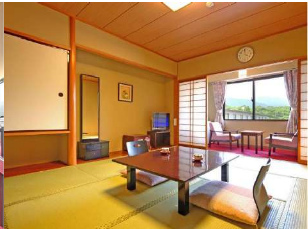
Japanese style Room sleep 4 /5