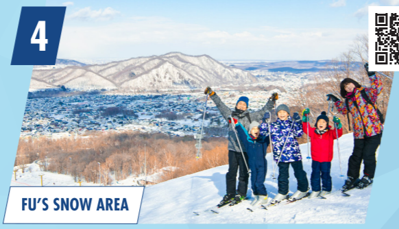
FU'S SNOW AREA

Close to Sapporo's residential neighbourhoods and easy on the wallet, Fu's Snow Area is a local favourite, especially among younger skiers and snowboarders. With six courses for all levels, it's a great choice if you're after a more laid-back, local feel, away from the beaten path.