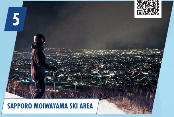
SAPPORO MOIWAYAMA SKI AREA

On the edge of the city and just roughly 30 minutes from central Sapporo, Moiwayama is a favourite for night skiing, with sweeping views of the skyline. It offers 10 courses, including the aptly named Dynamic Course. Suitable for all levels, it's a place to carve your way above the city lights.