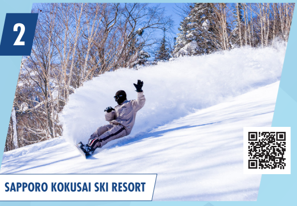
SAPPORO KOKUSAI SKI RESORT

Near the hot spring town of Jozankei, Sapporo Kokusai is celebrated for its top-quality light powder snow that keeps international skiers coming back. With courses for all levels and family-friendly facilities, it suits everyone. Don't miss the Hokkaido-inspired rice bowls and soup curry at the lounge.