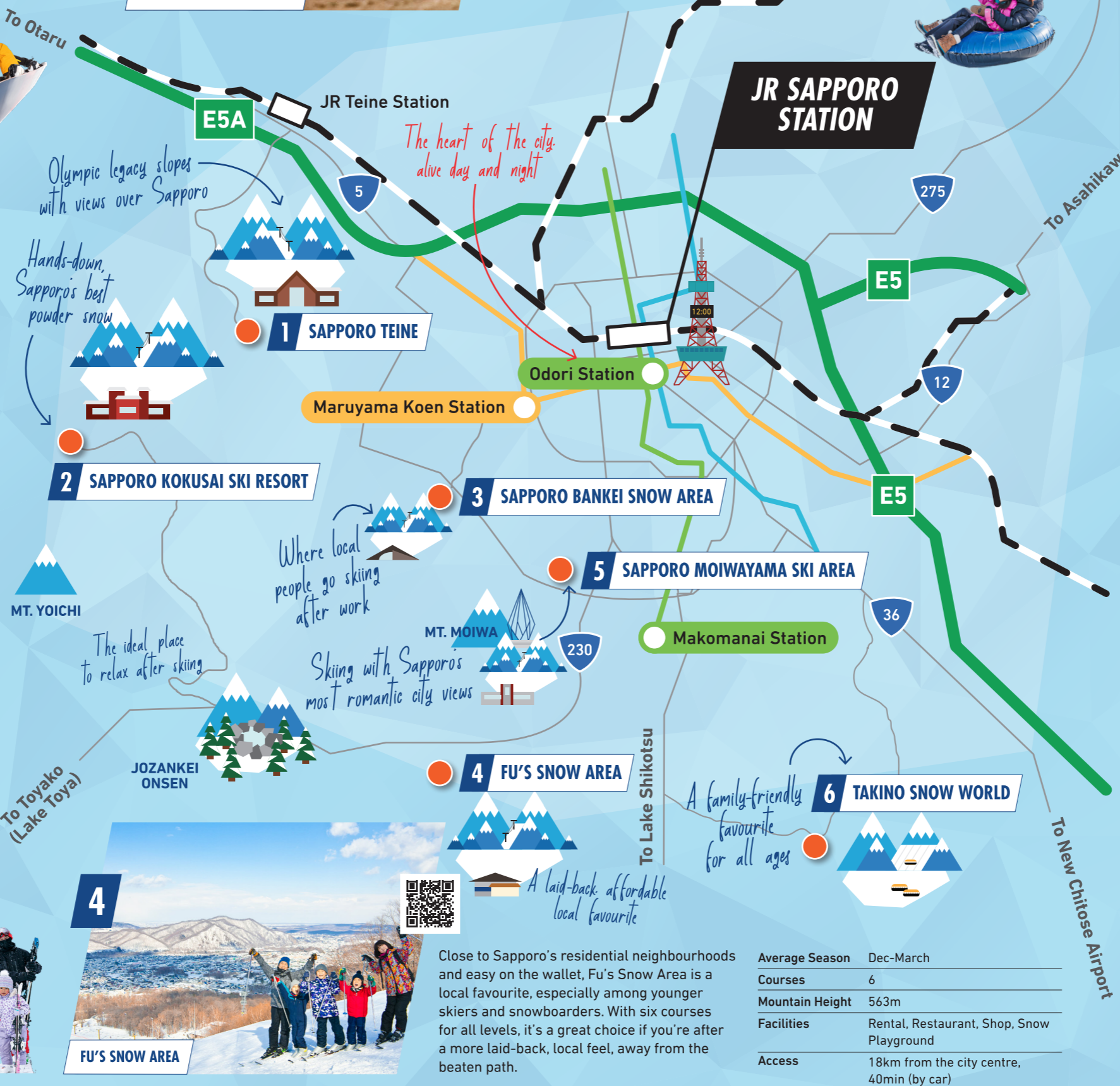
2 SAPPORO KOKUSAI SKI RESORT