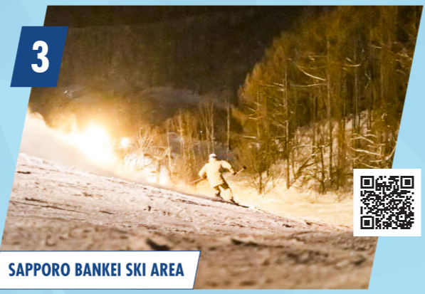
SAPPORO BANKEI SKI AREA

So close to the city and open until late, this is where locals ski after work. A short drive from the city center, Bankei has courses for all skill levels and a family-friendly snow park set safely apart from the main runs. With mogul and half-pipe courses, it also hosts international competitions.